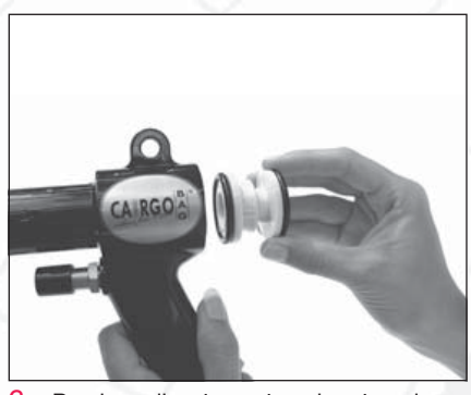
6. Put the yellow insert into the air tool.