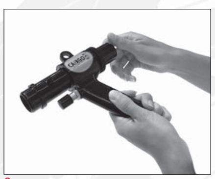
2. Screw off the back of the air tool.