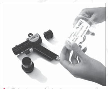
4. Take the supplied yellow insert out of the packaging.