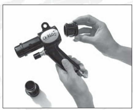
Pull the black insert and the O-rings out of the air tool.