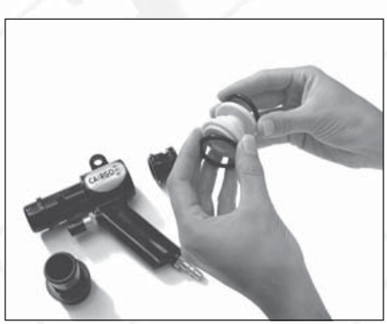
Place the two O-rings on the yellow insert.