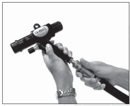
1. Disconnect the air tool from the air tube.